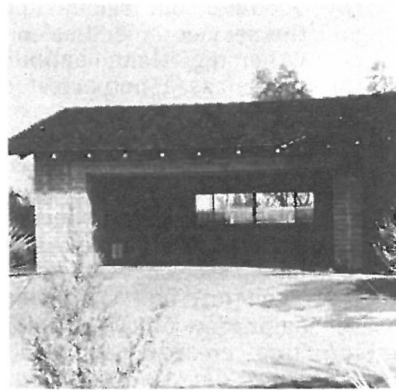
Our Second Worship Home